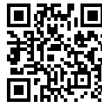
TABLE CUISSON INDUCTION PUNTO - NOIR 86x51 5 ZONES